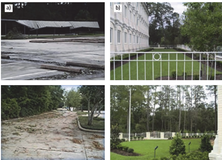
Figure 3. a) Parking lot adjacent to Peace Palace property; b) Peace Palace backyard and front yard

Hurricanes Rita and Gustav in Houston, Texas Peace Palace, 2005: In 2005, immediately after Hurricane Rita struck (the fourth-most intense Atlantic hurricane ever recorded till 2005), the area outside the Peace Palace's Vastu fence was filled with trees and tree limbs that were down everywhere. Inside the Vastu it was pristine, as though someone had taken a leaf blower and cleaned it...Exactly the same thing happened three years later after Hurricane Gustav hit. A visitor who came immediately after that hurricane to inspect the site for damage even asked whether someone had just come over to do yard cleaning because the yard was so immaculate (Sue Weller, Houston, Texas, USA, October 2008), (Figure 3)